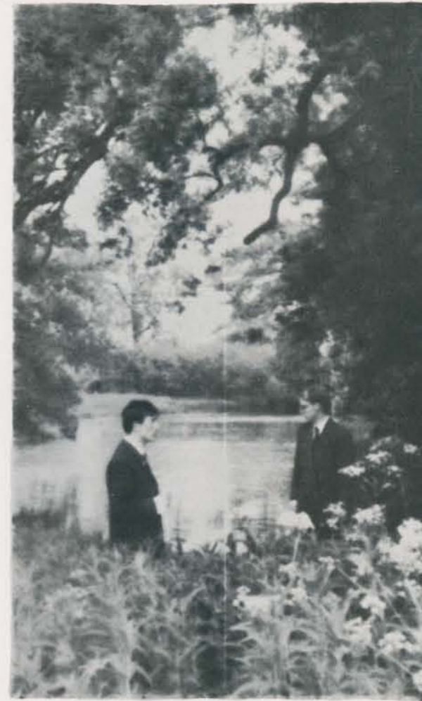
Simplicity for Meaning