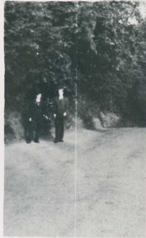
The Fire of Art